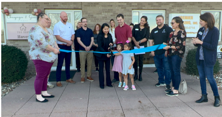
The Cozy Haven 121 SE Shurfine Dr, Ste 7 (515) 984-0194 https://www.facebook.com/thecozyhaven.ia