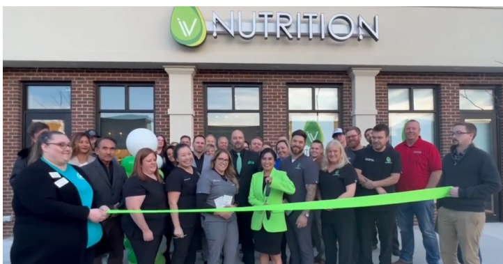
IV Nutrition Ankeny 2405 SW White Birch Dr, Ste 105/106 (515) 444-1299 https://ivnutritionnow.com/