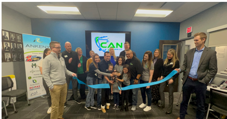
Can Cleaners, LLC (515) 901-0664 www.thecanisclean.com