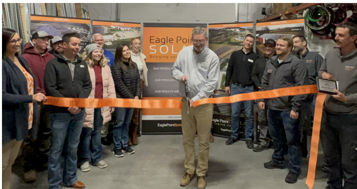
Eagle Point Solar - Des Moines 1955 NE 58th Ave, Ste 201, Des Moines (563) 580-5823 https://eaglepointsolar.com/