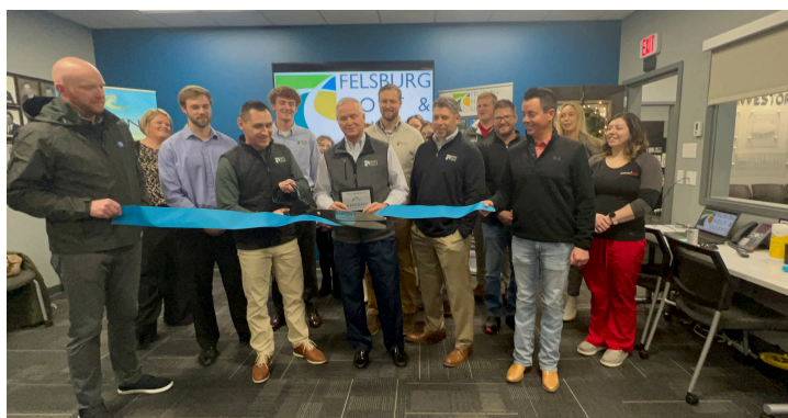
Felsburg Holt & Ullevig 1300 Walnut St, Ste 101, Des Moines (515) 493-2757 https://www.fhueng.com/