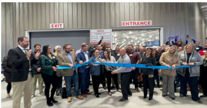
Costco Ankeny 4000 NE Spectrum Dr (515) 686-8726 https://www.costco.com/