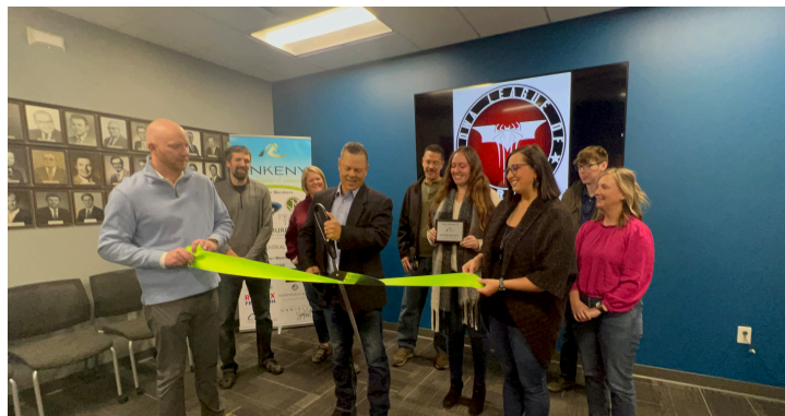
Iowa League of Heroes (515) 419-8269 https://iowaleagueofheroes.com/