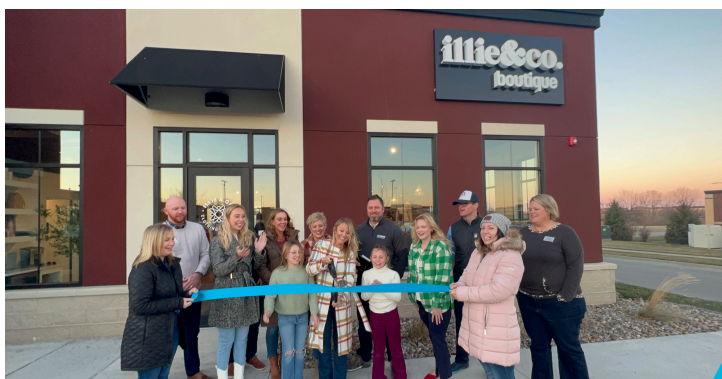
illie & co. boutique 1915 SW Plaza Pkwy (515) 822-9684 https://www.illieco.com