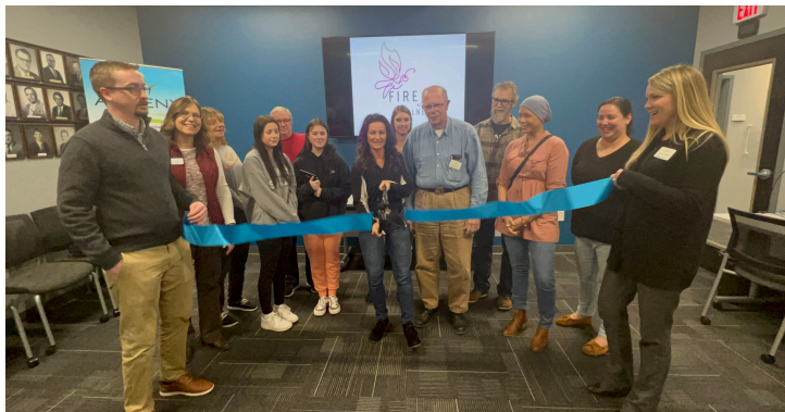
Firefly Wellness (515) 210-8958 www.fireflywellness.us