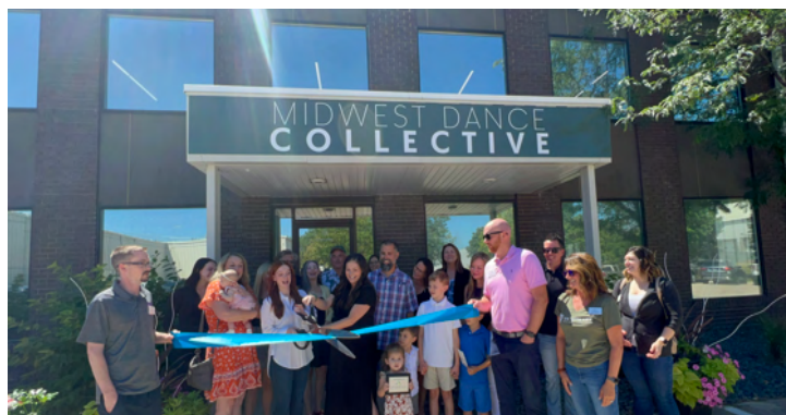
Midwest Dance Collective LLC 1802 SE Delaware Ave, Ste 115, Ankeny (515) 212-5066 https://www.midwestdancecollective.com/