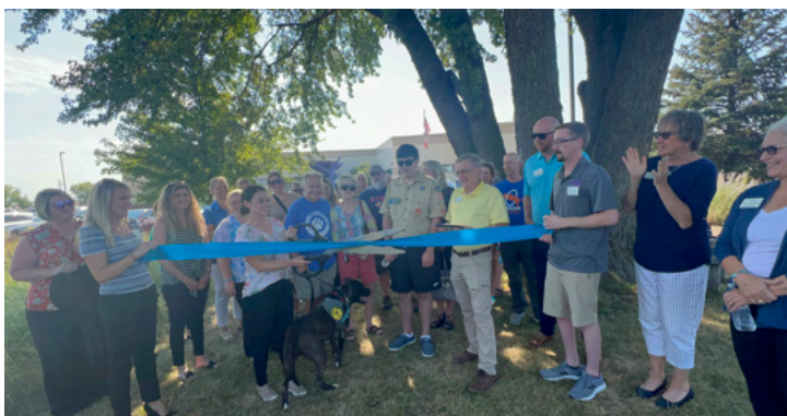
Animal Rescue League of Iowa 5452 NE 22nd St, Des Moines (515) 262-9503 https://www.arl-iowa.org/