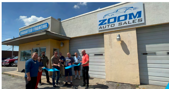
Zoom Auto Sales 4200 E 14th St, Des Moines (515) 262-2003 www.zoomautodsm.com