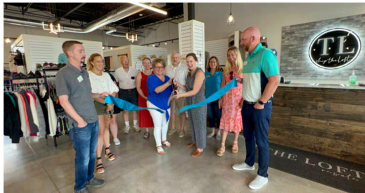
The Loft Resale- Ankeny 2405 SW White Birch Dr, Ankeny (515) 450-1766