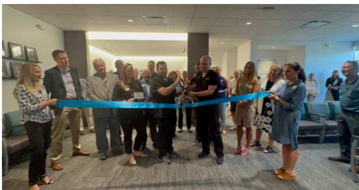
Wolfe Eye Clinic- Ankeny 800 E 1st St, Ste 2500, Ankeny (515) 676-7014 https://www.wolfeeyeclinic.com/locations