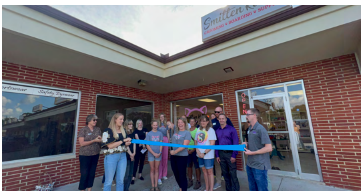
Smitten Kitten 322 S Ankeny Blvd, Ankeny (515) 333-4620 https://desmoinesgroomer.com/