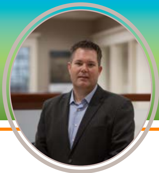
Central Bank Mortgage Loan Officer mycentral.bank